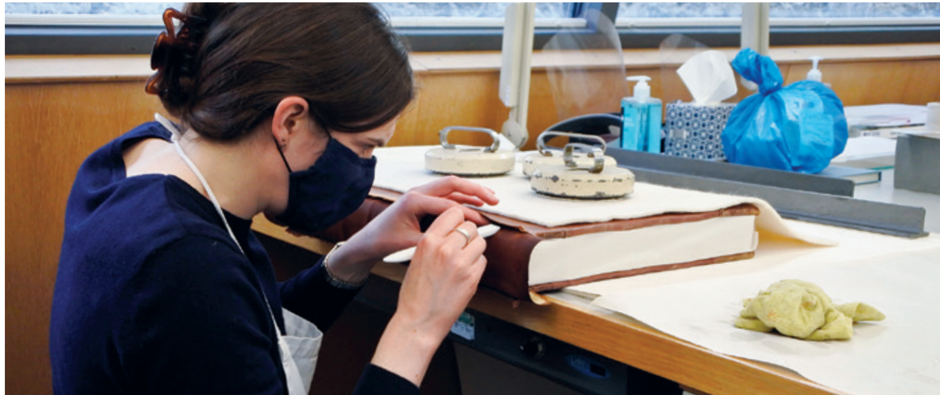
Rebacking a large volume of 'British Zoology' (Sel.g.33) from The Queen's College, Oxford (see page 24).

We are enormously grateful to all of our donors in the year to the end of November 2021 and, in particular, to our major donors, The Clothworkers' Foundation and the Dulverton Trust.