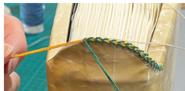
Above right: Katie stitching the text block.