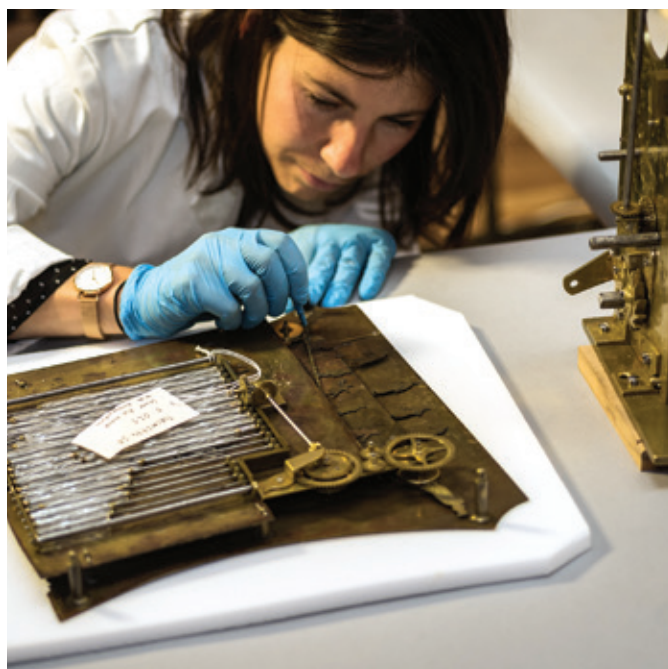
Assembling the bell-hammer assembly of the York Automaton Clock.

The Trustees like to keep in touch with past recipients of Plowden Scholarships, and are gratified to learn of their success as they establish their careers in conservation. Here are a few examples of the contribution that our Alumni are now making to the sector.