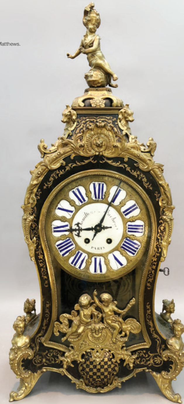
Louis XV Grand Cartel Clock before work.

Removing the door of Grand Cartel Clock.