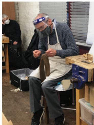
Participant on a CPD course on leather conservation (see page 16).

In 2020 the Trust received 48 applications for Plowden Scholarships. We had anticipated a lower level of demand due to Covid-19, but received almost as many applications in 2020 as in 2019. A total of 27 grants were awarded to a value of nearly £64,000. As always, the Trustees were impressed by the applicants' commitment to train as conservators in the face of the seemingly insurmountable task of raising sufficient funds to do so – particularly in these Covid times.