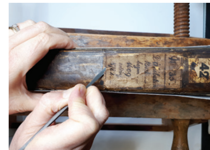
Lifting a damaged C17th label for consolidation and repair.

Thank you to the Anna Plowden Trust and The Clothworkers' Foundation for enabling me to undertake this transformative experience, and for giving me the funds to take my business under control and to the next stage of its development. I still have some way to go, but the Leadership Launchpad has given me the strong foundations on which to build future success.